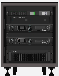
XPT(Extended Pseudo Trunking) system

The requirement for safety in large arenas has accelerated in recent years, placing extra pressure on facilities management teams. An increasing issue within large establishments is bomb threats. In this instance, large arenas in Melbourne were finding it ever more difficult to find the correct communication systems with the broadcast capabilities that are necessary to resolve the problems efficiently. The conventional communication systems could no longer meet the communication demands of day-to-day work. Working with an individual channel system caused important tasks to be more difficult than necessary, whereby having emergency services on different channels became a complicated disaster.