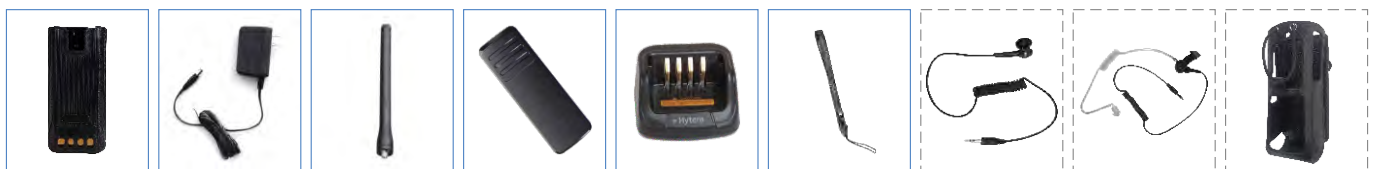
2850mAh Li-ion smart anti-counterfeit BL2801-Ex