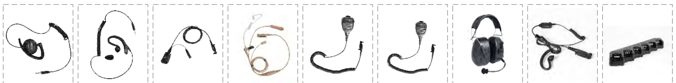
Receive-Only Swivel Earpiece with Adjustable Ear hook EH-02