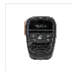
BT Wireless remote speaker microphone