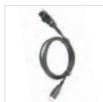
Programming cable (USB port)