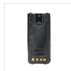
Li-polymer battery 2400mAh