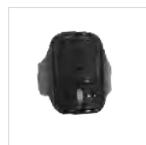
BT Wireless ring PTT